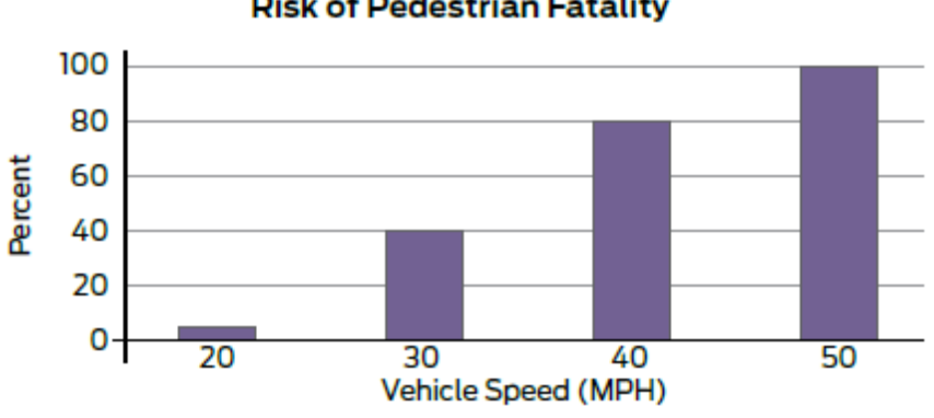
Risk of Pedestrian Fatality